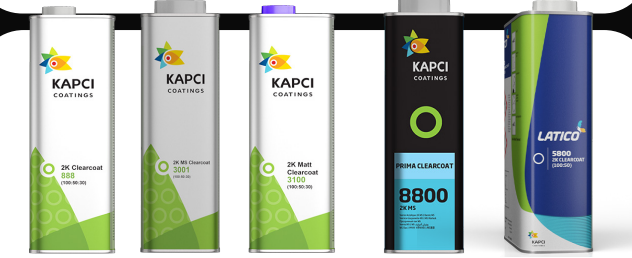
Kapci 888/3001/3100/3200/3300 Kapci 3100Matt/3150Matt • Prima 8800 Latico 5900/5860/5850/5800/5920