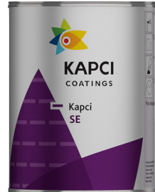
Kapci SE Synthetic enamel