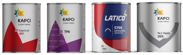
Kapcicryl • Kapci TPA Laticocryl • NC Topcoat