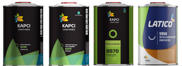
Kapci 6030/40/50/70/80 • Prima 8870 Latico 5950