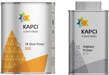
Kapci 800/805/810/820/870/873/875/880 Kapci 615 Adplast Plastic