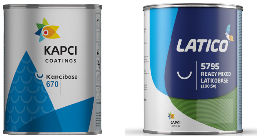
Kapci Base Latico Base