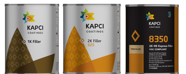
Kapci 625/626/630/633/634/635 Kapci 1K Filler • Prima 8350